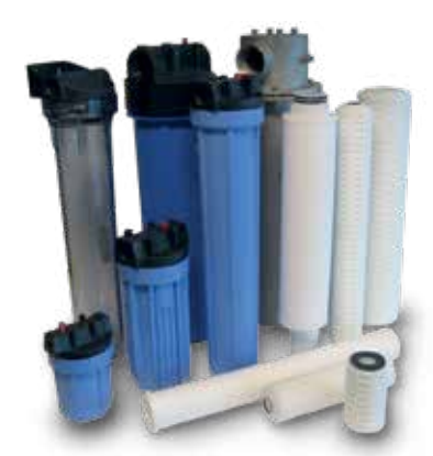
A wide range of filter housings and cartridges for pre-filtration is available.

It is recommended to use filters from the Danfoss filter product range.